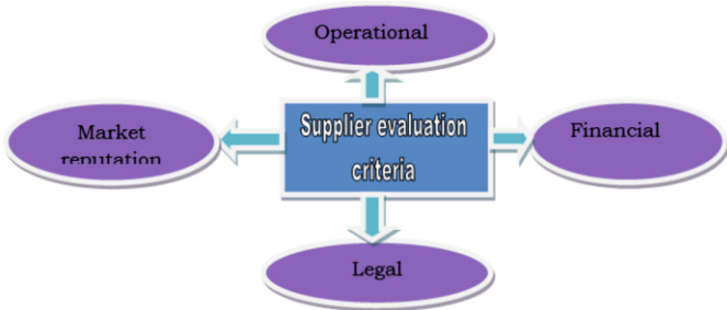
Exhibit-1: Supplier's evaluation criteria

It is clearly visible from above table that industry ranks equally the operational and market reputation criteria. Thus, good market reputation of supplier is as important as operational criteria. For improving the position and for efficient management of accounts payable proper care and attention is needed of higher management.