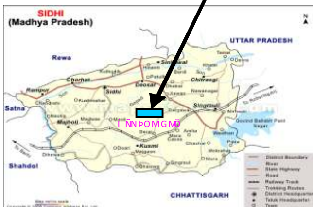
Map. 1 Location map of Madhya Pradesh and study area of Sidhi district.