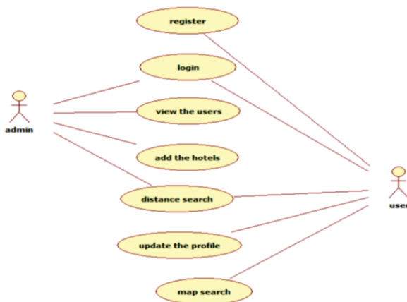
Fig. USE CASE Diagram with Relationship